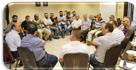
SGBV training men 11-13 July

"During the training, I have applied skills that helped me improve the quality of my relationship with my children."