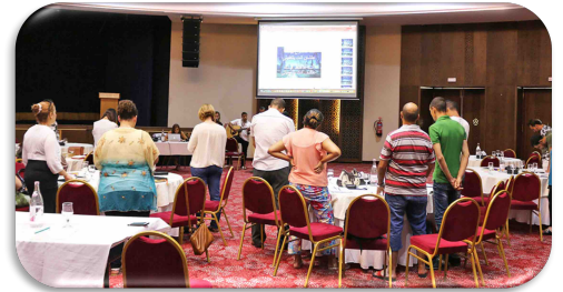
Regional training Tunisia

Men had their own sessions around the topic of conflict resolution , where they worked professionally, by the support of a previous judge and a current pastor lecturer, on solving some practical case studies relating to the topic, which would support their ministry and personal life.