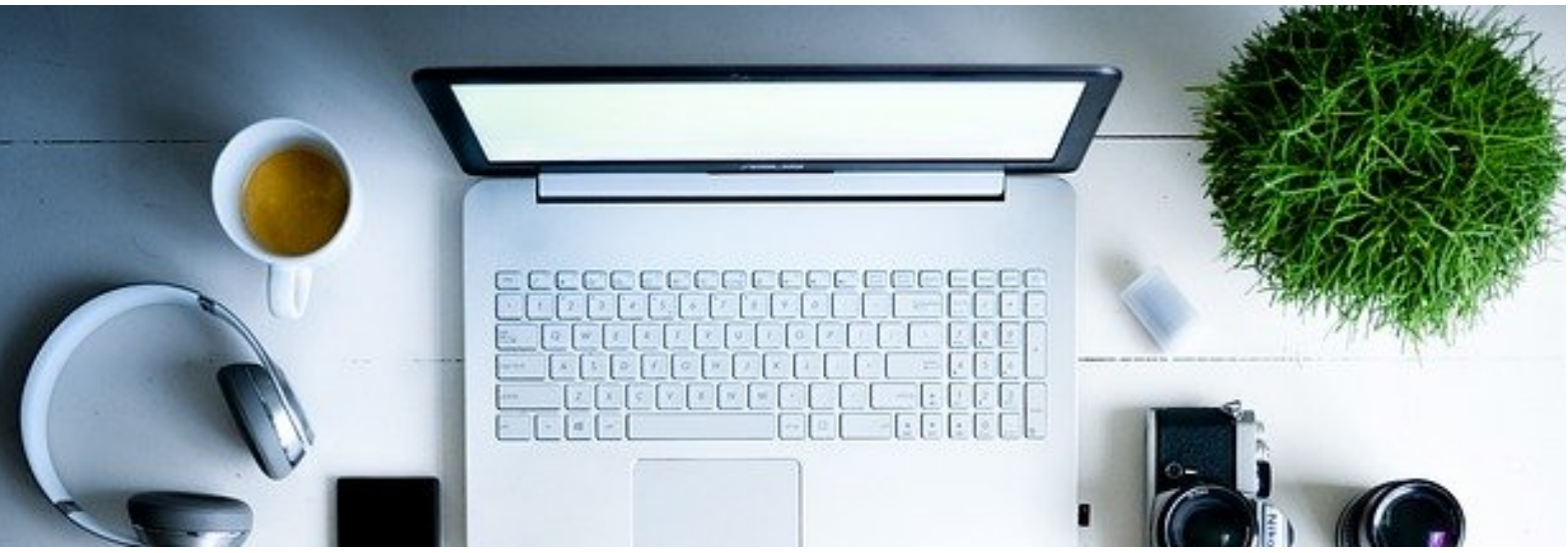
Youth / End of year Report 2020

We had to embrace new styles of working, communicating, and collaborating. Remote working and homeoffice have swiftly become the new norm with a growing reliance on the web and new technologies to support our projects, staff, and partners across our organization.